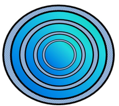
Figure 3: Multilayer Liposome (MLV)