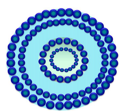
Figure 2: Large Vesicle, Multilayer Liposome [10]